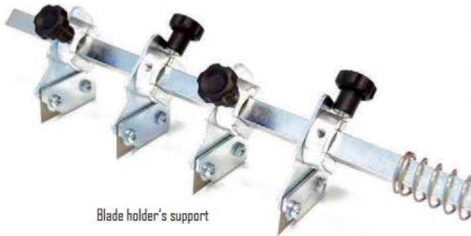
Blade holder's support

The new label slitter, equipped with two 3" fixed core holder is able to work rolls with a diameter of 250mm. The maximum width of the roll is 220mm and it is possible to obtain rows of labels not narrower than 22mm.